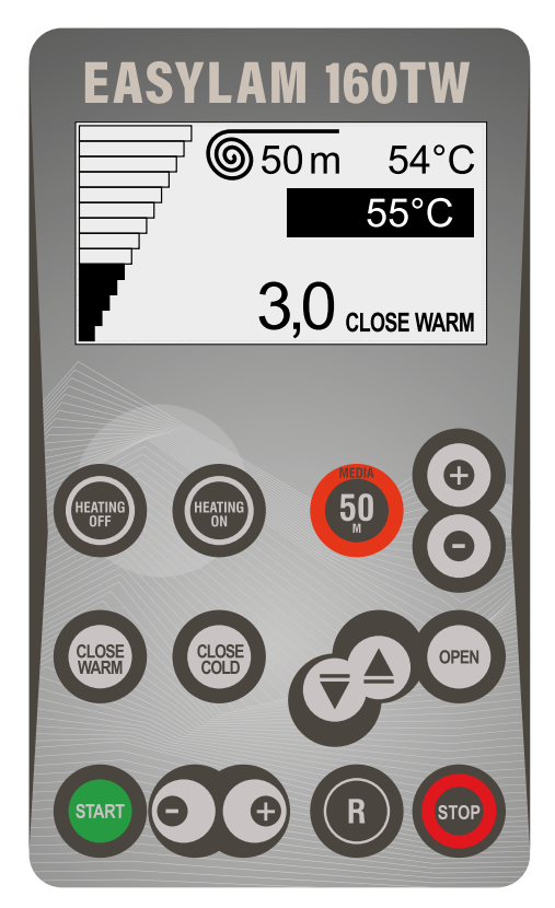
Simple operation through intuitive keyboard.