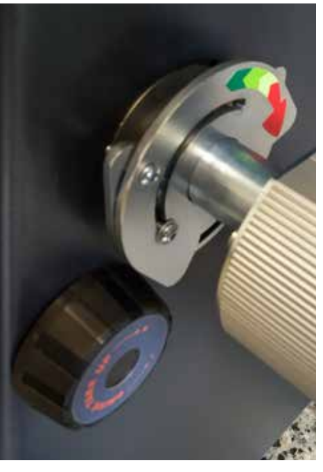
Brakes and slip clutches for all axles