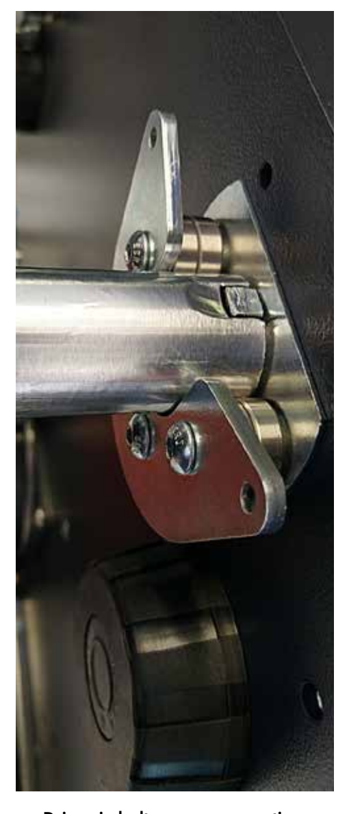
Drive via bolt-groove connection