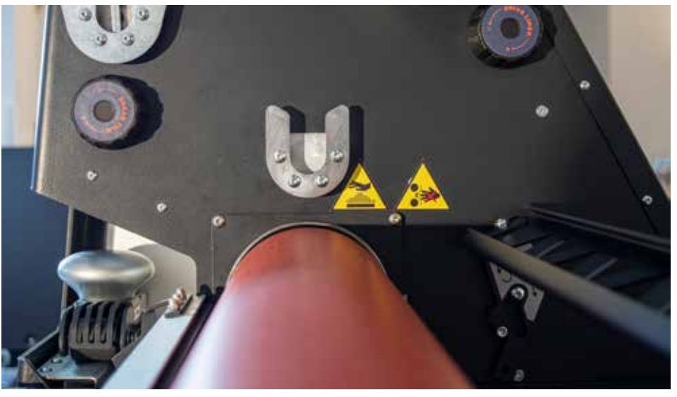
Separate receptacle for APP film