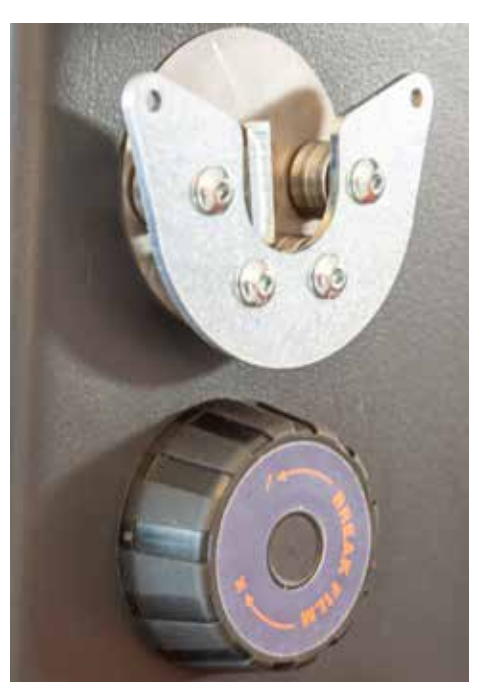
Ergonomic rotary knobs